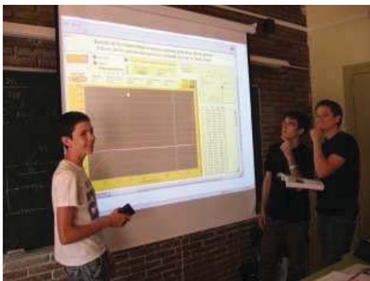
Figure 4. Students using the remote lab as demonstrator in the classroom in their High School

Seven High Schools from around Catalonia were selected and their Technology teachers were contacted. The amount of students of their Technology subjects in the two last years of High School was around 100. All of them were invited to visit the physical laboratory that supports the remote experiments in a specific Telecom BCN School Open Doors day. This was a good activity, useful not only to increase the feeling of reality of the remote lab but also to show the students the School laboratories and facilities and even the research activities. During the last term of year 2008, they performed classes based on the remote lab, mainly using two modalities: taking the whole group to the computer room and carrying out the experiences described in the didactic guides or using the experiments as demonstrators in the classroom using a projector (Figure 4).