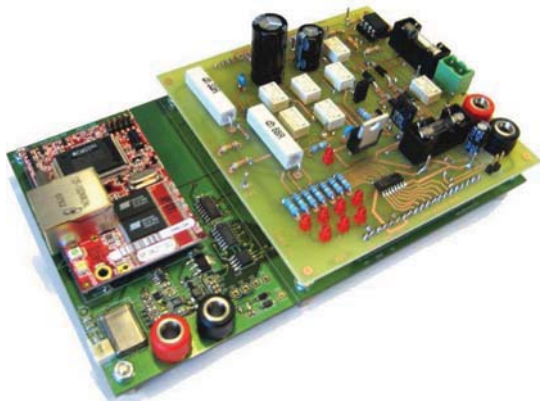
Figure 1. A main board with the experiment board 2 connected on its top. It implements a configurable linear power supply.

The main board has a single 5V input power supply and provides +/- 5V to the daughter board. The connection between both cards also include 4 A/D and D/A channels, 8 I/O bits and a selectable serial bus (SPI/I2C). iLabRS structure consists of several main boards, each of them with its own IP address, connected into a LAN through a switch with a dedicated server. This server is in charge of running the NI - LabView programs which implement the user interface and control. Teachers or students can perform experiments using a web browser to access to the iLabRS web site ( http://ilabrs.etsetb.upc.edu ), which contains didactic materials for each experiment and also the url to the LabView remote panel (Figure 2) which gives the control of the experiment.